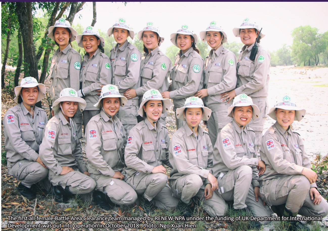
The first all-female Battle Area Clearance team managed by RENEW-NPA under the funding of UK Department for International Development was put into operation in October 2018.