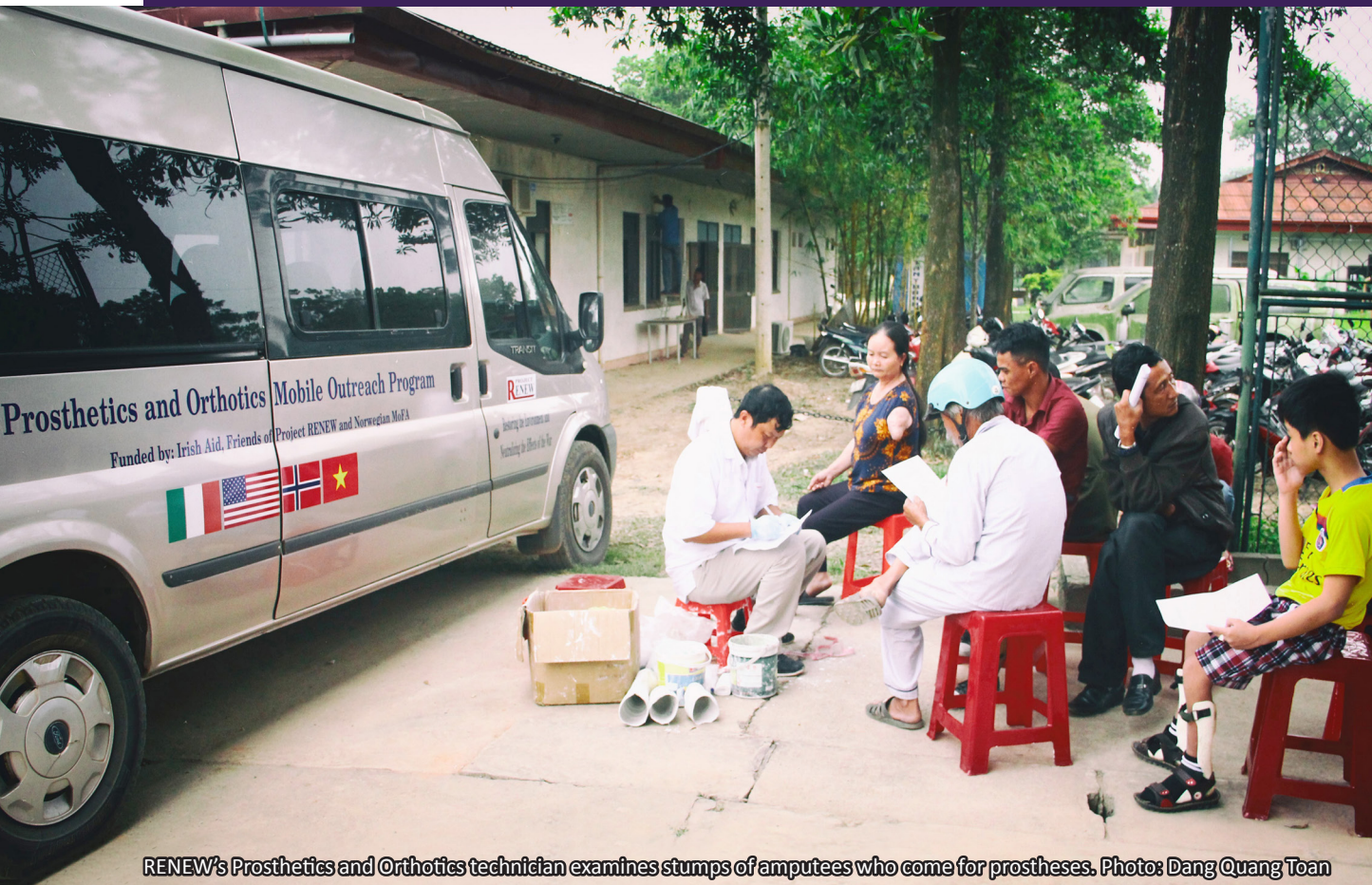
RENEW's Prosthetics and Orthotics technician examines stumps of amputees who come for prostheses.