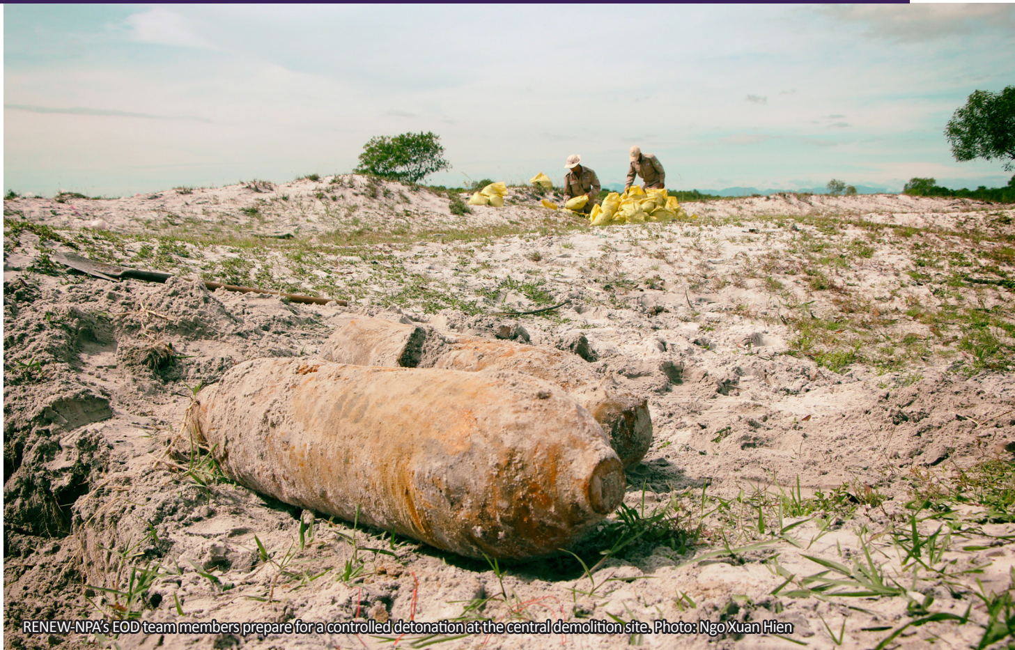
RENEW-NPA's EOD team members prepare for a controlled detonation at the central demolition site.